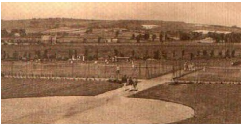
Anyone for tennis, just after the opening in 1924.

The Sandham Grounds Recreation Park officially opened on Friday 13 th June 1924, without